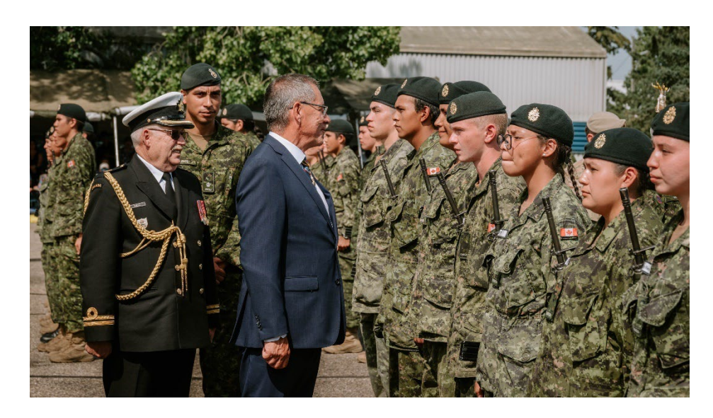
August 11, 2022 Bold Eagle Graduation Wainwright