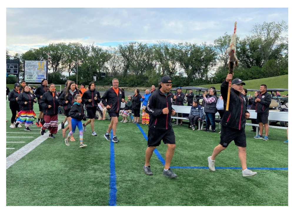
July 25, 2022