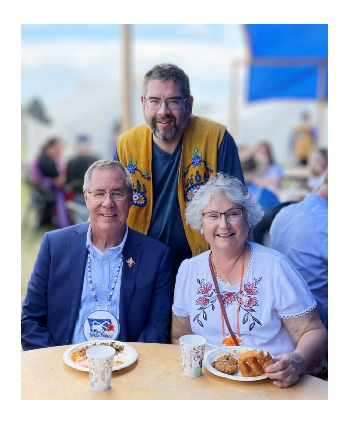
July 22, 2022 Back to Batoche 50<sup>th</sup> Anniversary